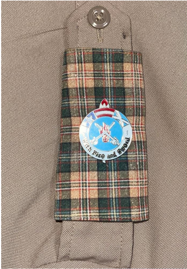
WITH EPAULET COVER